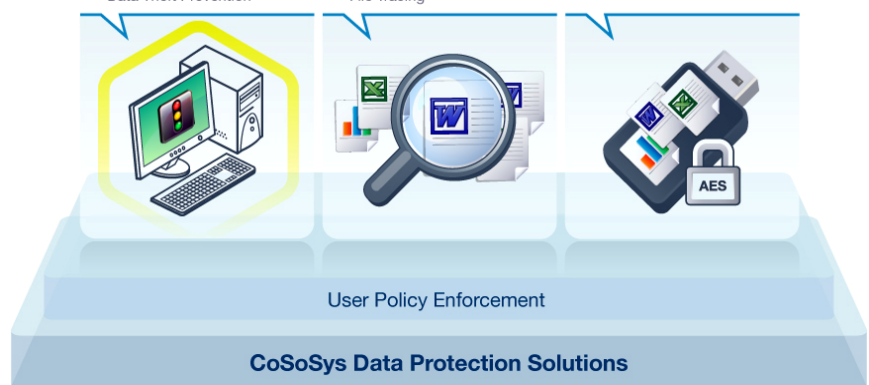
Endpoint Protector 2009 is built on a three Pillar Security Architecture. Prevention – Monitoring – Encryption & Enforcement